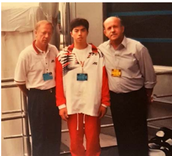
From left: Nikolay Andrianov, Naoja Tsukahara, Anton Gajdoš