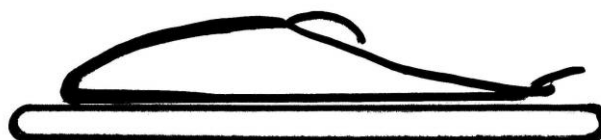
Figure 2. Static stretching exercise included in ASS protocol, to statically stretch antagonist hamstring and lumbar muscles. (ASS: Antagonist muscles static stretching).